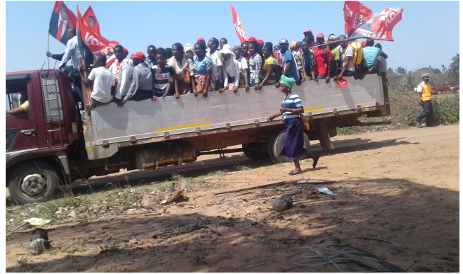
On the road to Zavala rally

He went on to explain how the $375 mn of capital gains tax from the sale of part of the further off-shore area by ENI to Exxon Mobil was used: $205 mn to rehabilitate the main north-short road (EN1) in Inhambane and Sofala, $70 mn to repay government debts, and $100 mn for the state budget.