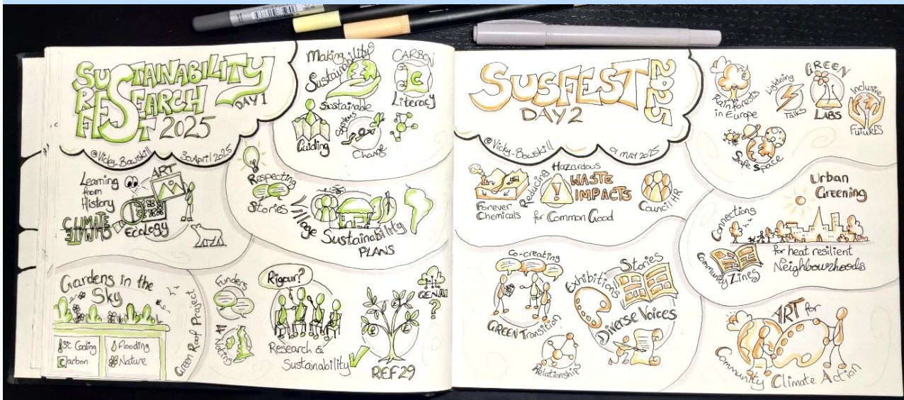
SketchNoting at the OSC Sustainability Research Fest 2025