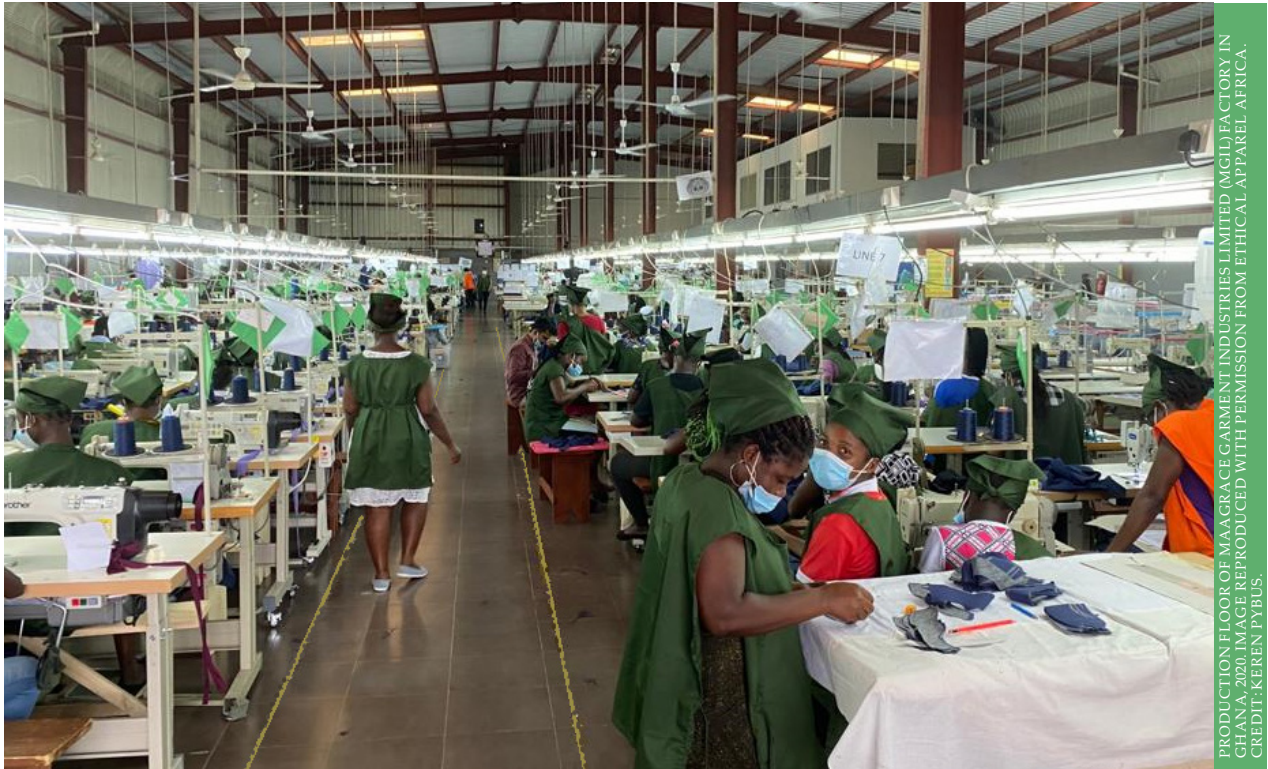
PRODUCTION FLOOR OF MAGRACE GARMENT INDUSTRIES LIMITED (MGI) FACTORY IN GHANA. 2020.

Incentivised by the crisis, governments are also responding with longer-term thinking. For example, South Africa had been importing much of its paracetamol, manufactured in India by a South Africa-based company. As the crisis bit, the country was (like others) ‘within five weeks of running out of paracetamol’. The Ministry of Health responded with a task force to look at localisation of supplies and market access for local producers.