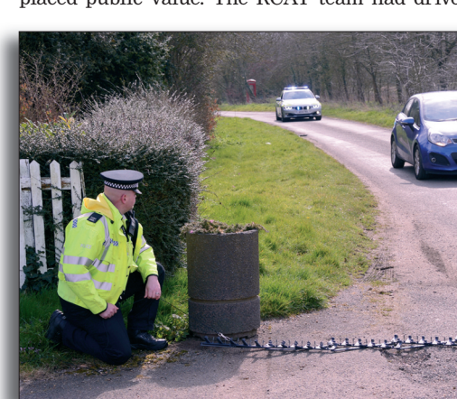
Adding value - property marking for specialist farm equipment and training with 'the stinger

As well as lost public value, the researchers identified displaced public value. The RCAT team had driven a lot of